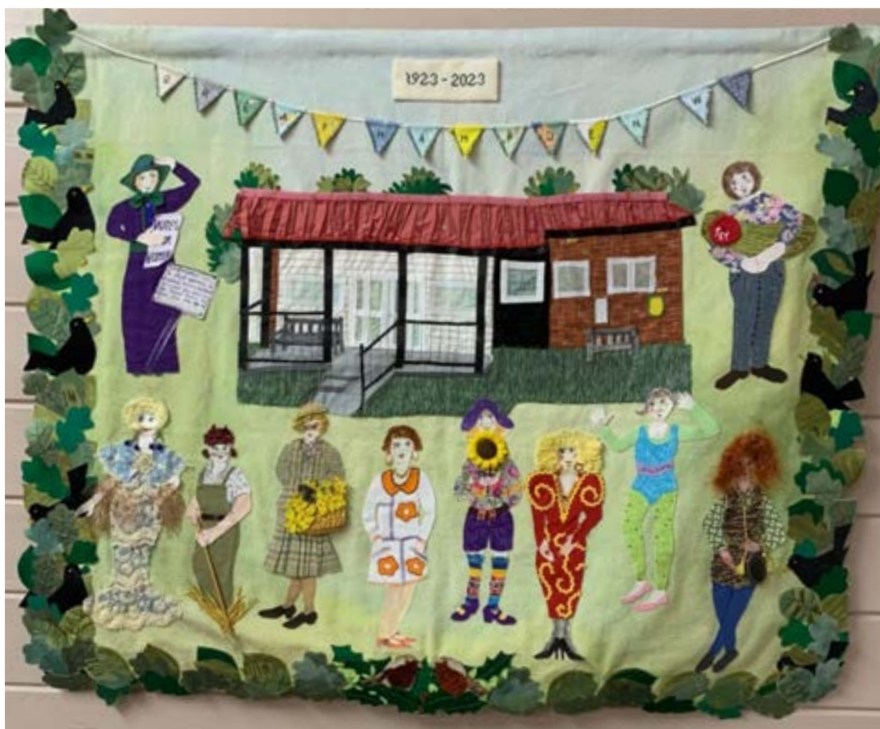
A celebration of 100 years of Great Hampden Women's Institute